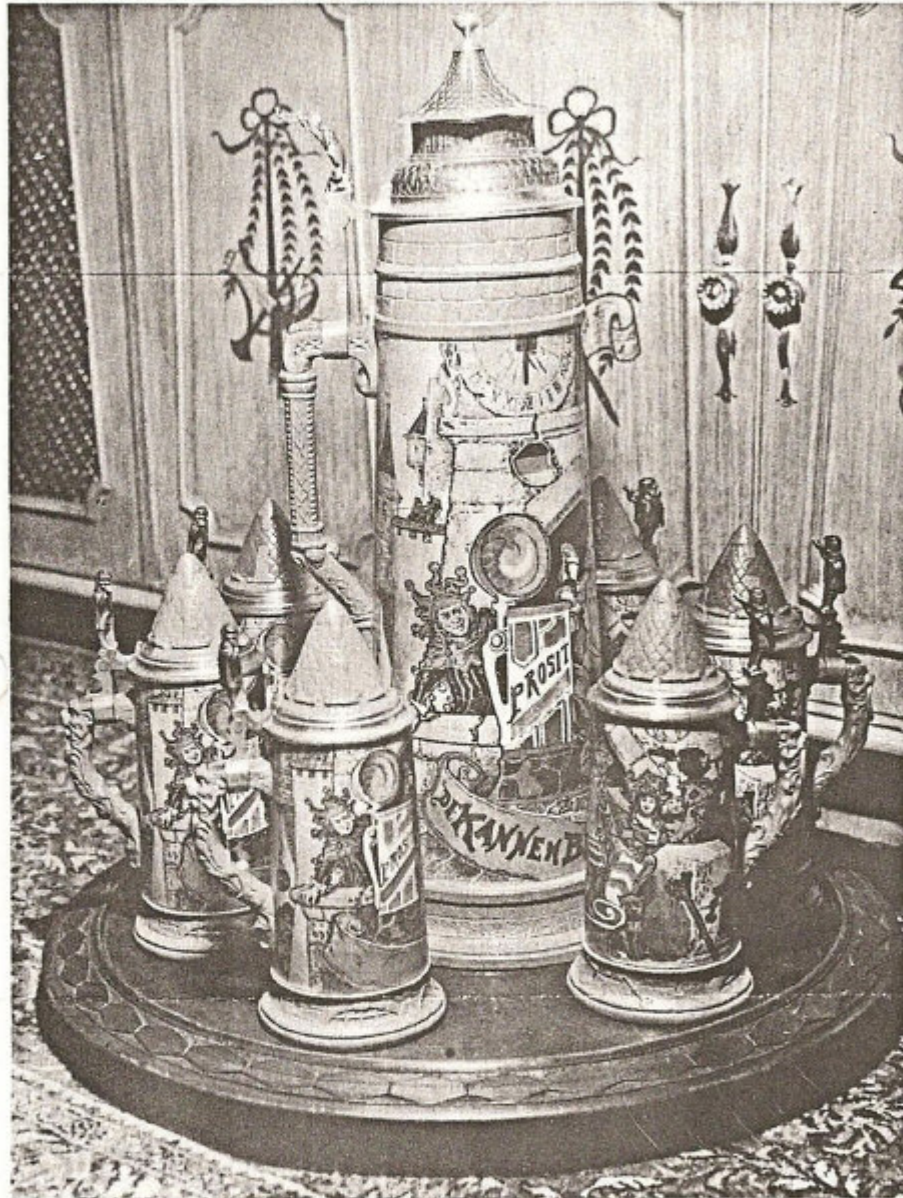
The pride of the Ray Sanders' collection are these Mettlach steins that once were property of Anheuser Busch of St. Louis.