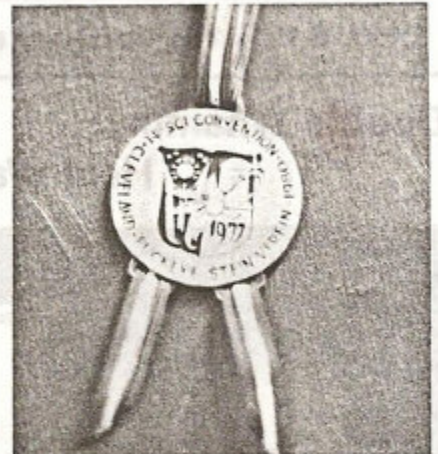
The novel and beautiful pewter Convention medallion