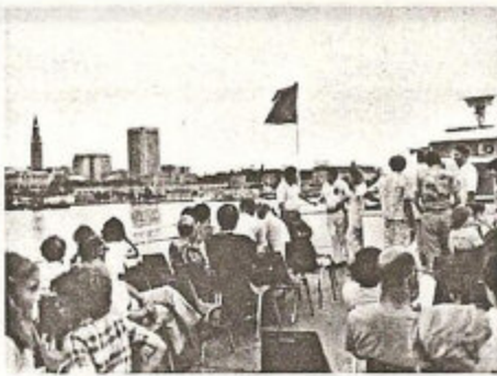
On Lake Erie on the good ship "Goodtime II"—with the Cleveland skyline as a proper backdrop

The convention activities were launched on Wednesday afternoon with an Early Bird cocktail party. More and more, the Early Bird day is becoming an integral part of the convention. The cocktail party was followed by a delightful trip into Lake Erie and up the Cuyahoga River (an Indian name, meaning "crooked") on the cruise boat Goodtime II . The 225 participants found their sea legs while viewing the Cleveland skyline, the sprawling industrial complex in the River Flats, and the many unique bridges that span the Cuyahoga—while partaking of Gambrinus' golden brew, enjoying a buffet dinner, and