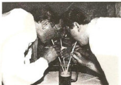
Drinking beer the hard way . . . !