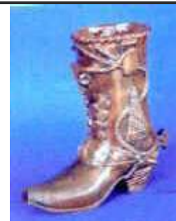
The 2000 SCI Convention Boot

There were several optional events for those attending with children. Among them were: