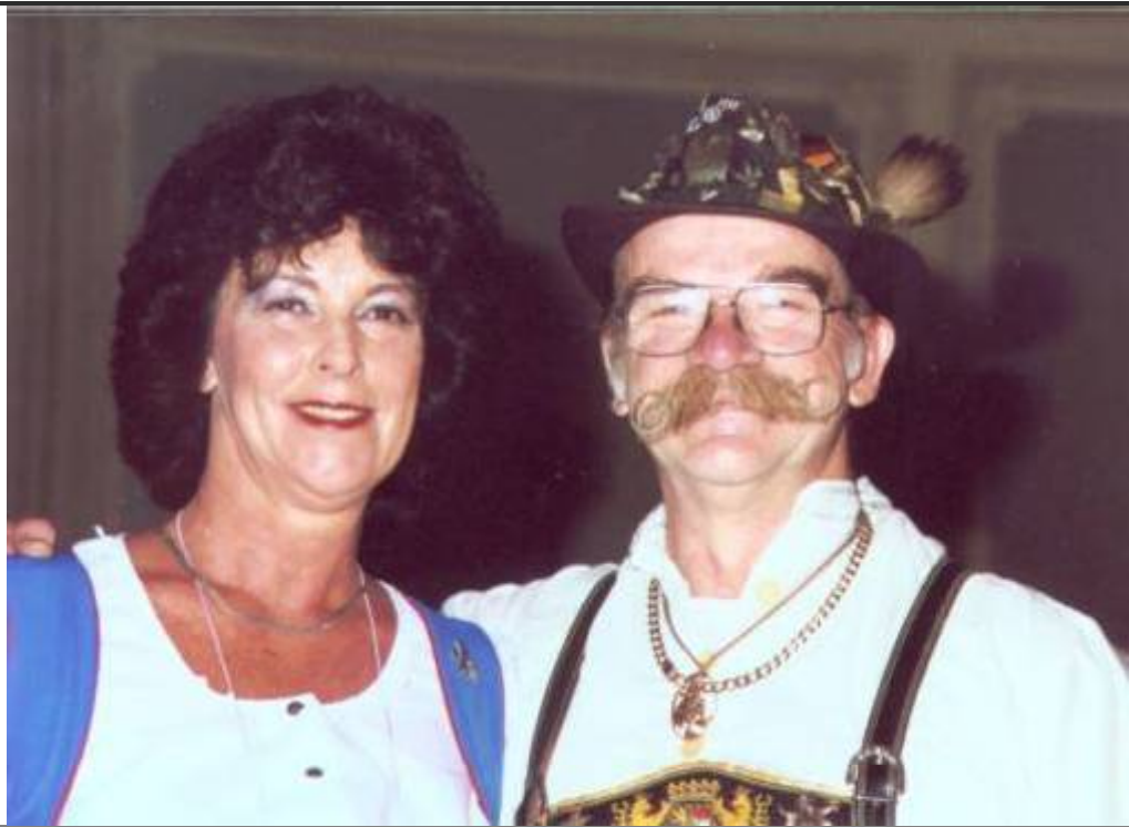
German night... Are we having fun?

© Stein Collectors International 1996-2014 All rights reserved.