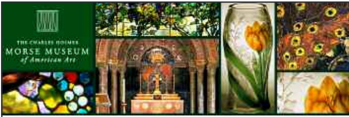
The Morse Museum in Winter Park, FL, contains exceptional examples of the work of Louis Comfort Tiffany.

ceptional and priceless. If you get a chance to be in this area make this a must see place to visit.