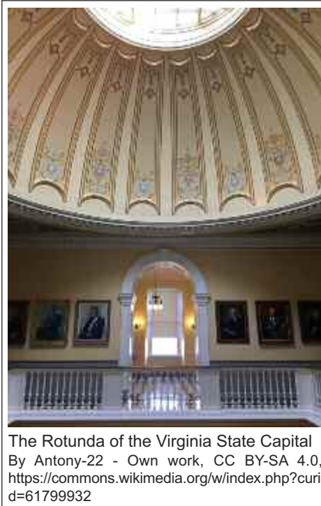
The Rotunda of the Virginia State Capital

We will be in the Rotunda, the Old Senate Chamber and the Jefferson Room. Docents will explain the various rooms to us.