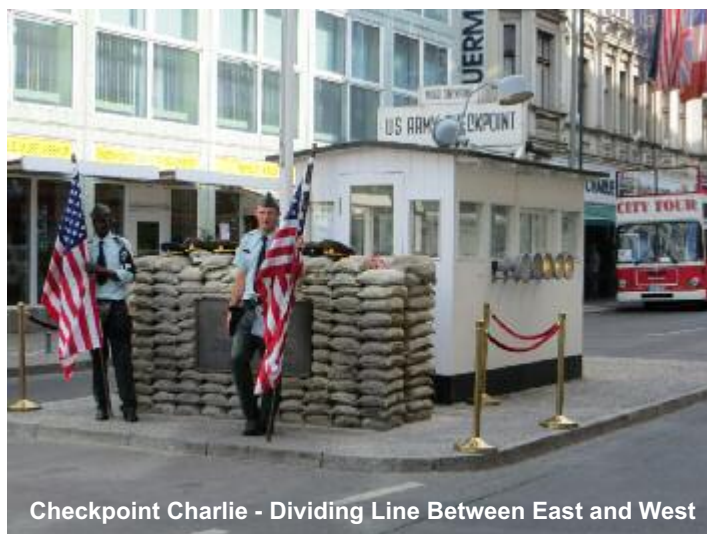
Checkpoint Charlie - Dividing Line Between East and West