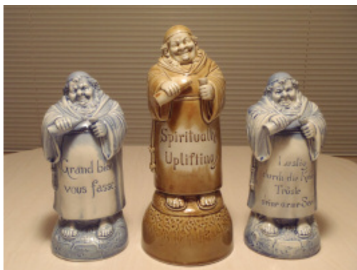
Drinking Monks: French, English and German.