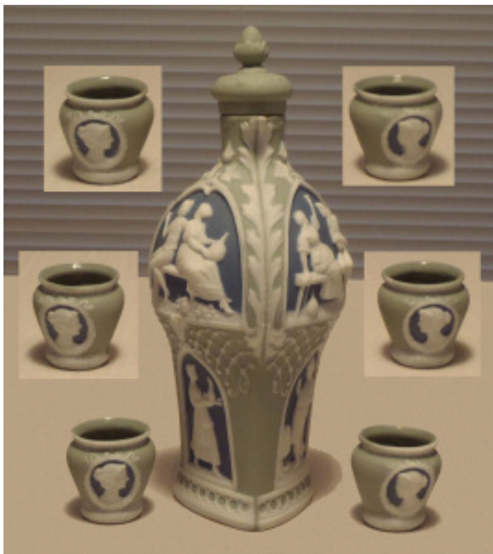
Cameo bottle with ornate stopper has three sides and there are six shots with this set.