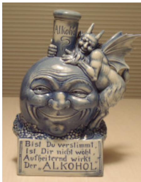
Der "ALKOHOL", The devil on the moon, 9" h.