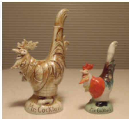
Mr. Cocktail, brown, 9.5", multi-color 6.5"

Here are some additional photos from my collection.