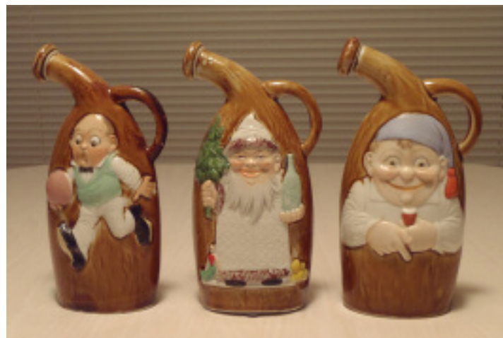
So-called "Cannon flasks", bent neck style, 6.2" h. From left to right, the bowler, Santa Claus, and Night Guy.