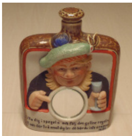
Flask with mirror, 5.2" h, Swedish inscription