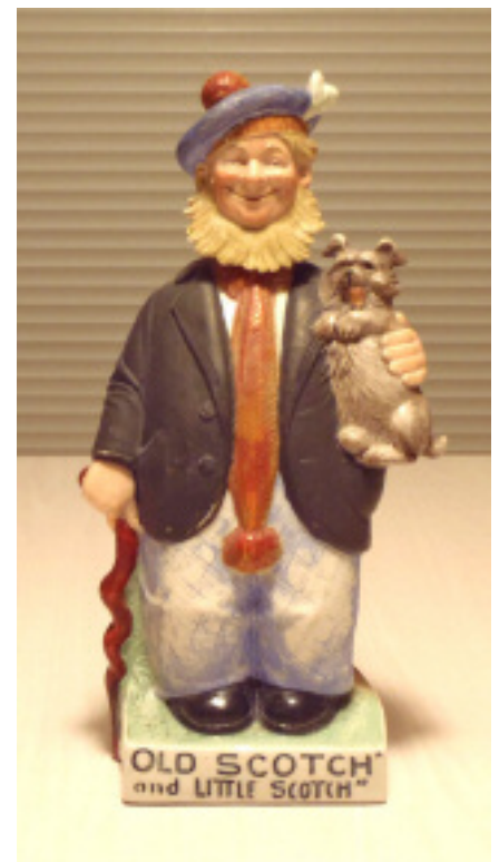
OLD SCOTCH and LITTLE SCOTCH, 9.2" h. The entire head is the stopper.

and many if not all of the music boxes were made by and presumably installed by an American company, suggesting that distribution of these large music box bottles may have been exclusive to the U.S., or at least to English-speaking markets. They all play an English language song ( How Dry I Am).