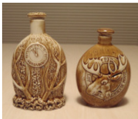
Flasks: BPOE or Order of Elks and Order of Moose