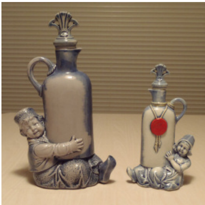
Dutch boy and girl. Note the ornate stoppers.