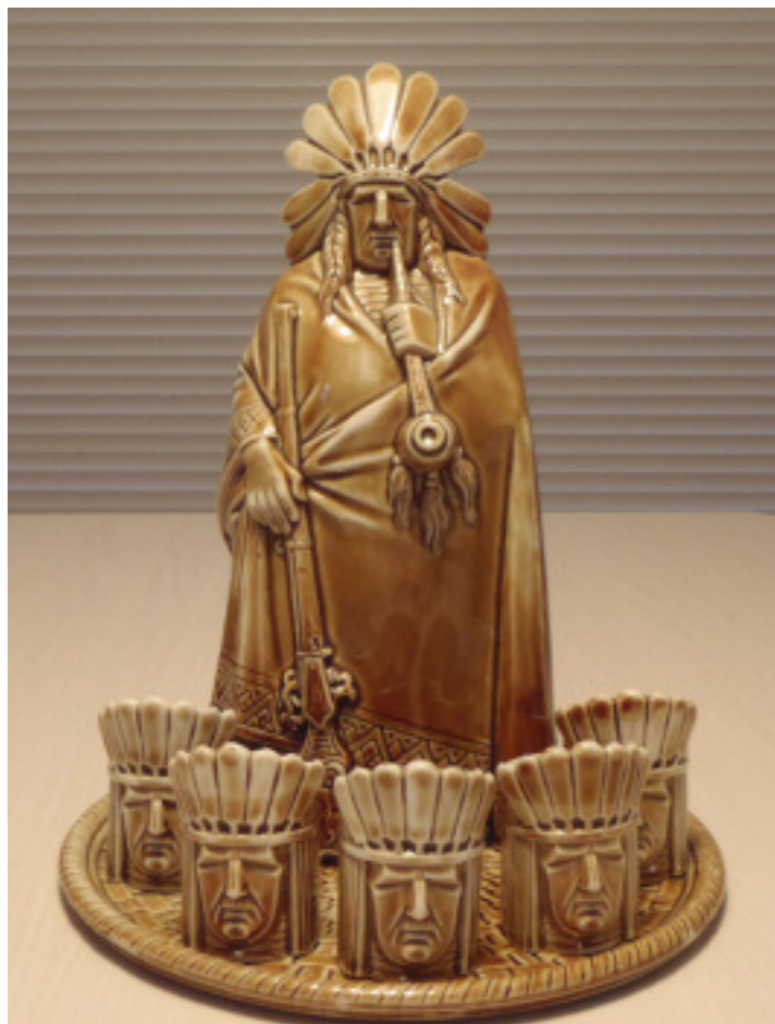
American Indian 9.5" tall with large 2.25" tall shots and 8.0" tray set.