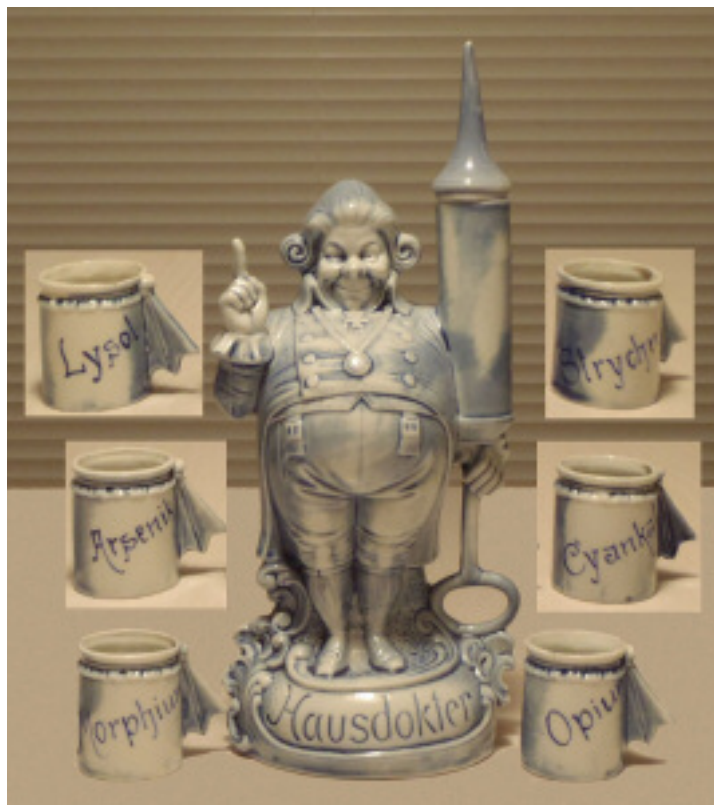
German Hausdokter, 9" h with 6 shots. Note the different titles on each shot.