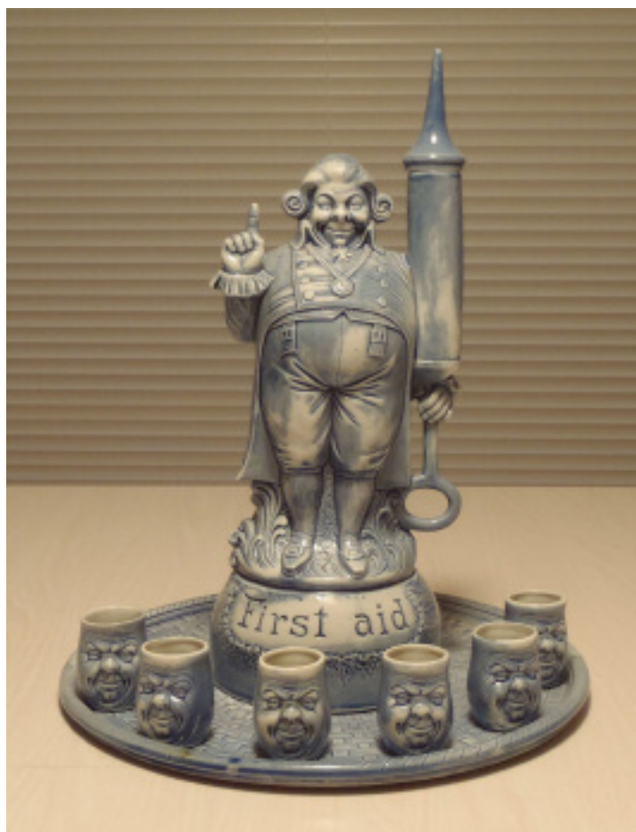
American version with music box, 13" h. "First aid" doctor with a large hypodermic needle, 6 shots, each 1.7" h, and an 11" tray.