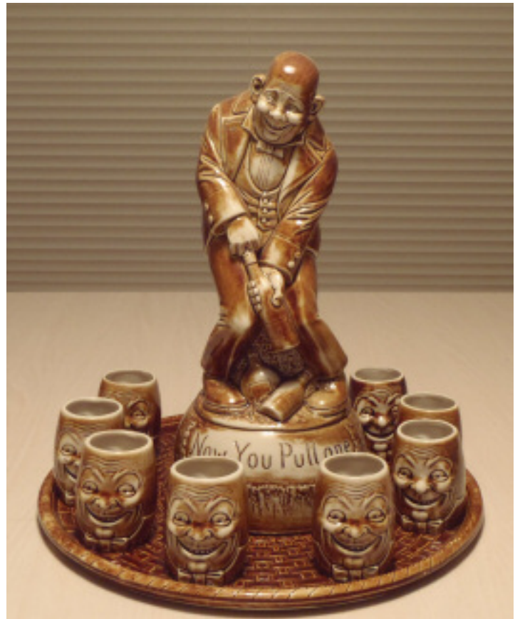
Complete set, 12" "Now you pull one" w/music box base, eight shots 2.25" tall and 11" tray.