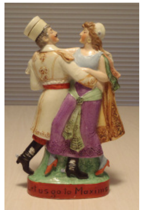
"Let us go to Maxims." 8.5" h, large molded letters on the rear base "New York, 110 West 38th Street. Molded S&V mark on the bottom plus stamped "Copyright by Maxims." Very rare.