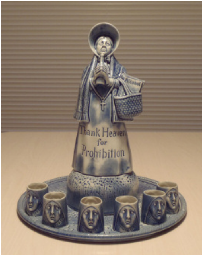
Lady wearing a cross and holding a bottle, 9.5" tall with shots and tray, German version without music box.

This is a good example of why I find collecting S&V so interesting and a challenge. I had the bottle for many years but could never find the shots and tray. Recently my son found 4 of the shots at an antique mall. I contacted some of my collector friends to see if anyone had the rest of the shots and tray. A collector had 4 shots and the 11.0" tray and sold them to me. The complete set has much more value than the separate pieces.