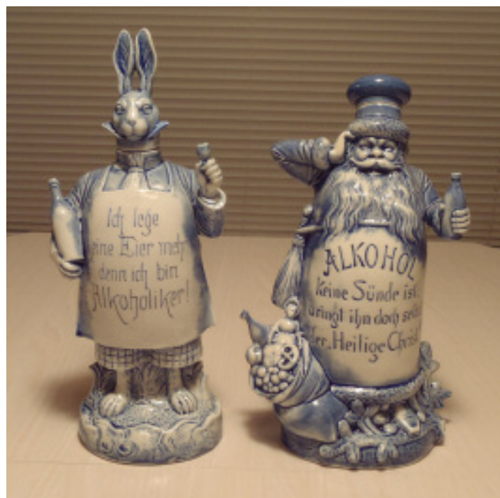
The drinking rabbit "ALKAHOLIKER" is 11.25" tall, and next to him is a German Santa Claus, 10" tall. Note the toys in his bag. The entire head of these pieces is the stopper.