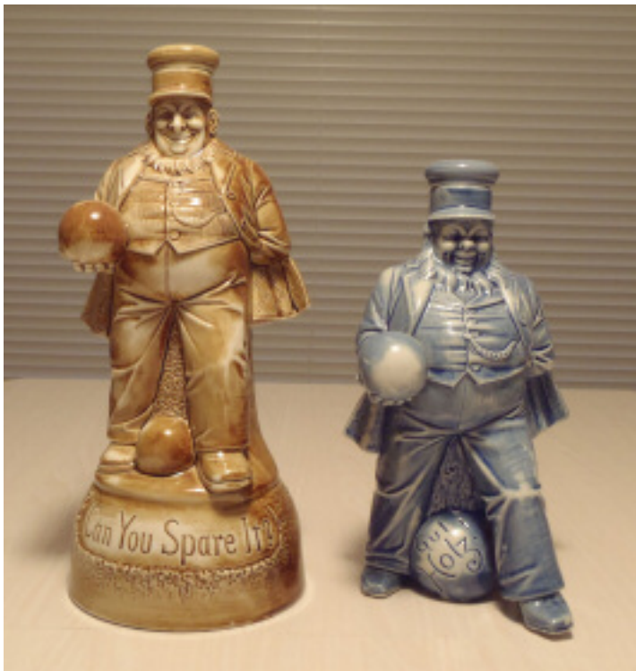
American version music box "Can You Spare It?" 12.0" tall, and German "Gut Holz!" bowler, 9.2" tall.