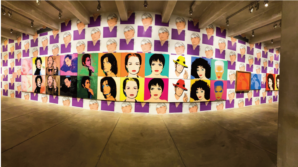
Andy Warhol Museum: Dive deeper into pop art.